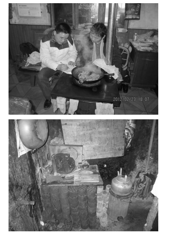
Fig. 2. Cooking or heating in winter season in inner-city areas of Zunyi.

Asthma-related symptoms are defined as subjects who reported wheezing with breathlessness or wheezing in the